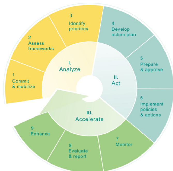
Figure 2: ICLEI's GreenClimateCities Methodology

As a city that has already undertaken significant climate action work, Rajkot was supported through the Urban-LEDS project to streamline previous practices according to the steps of the GCC methodology